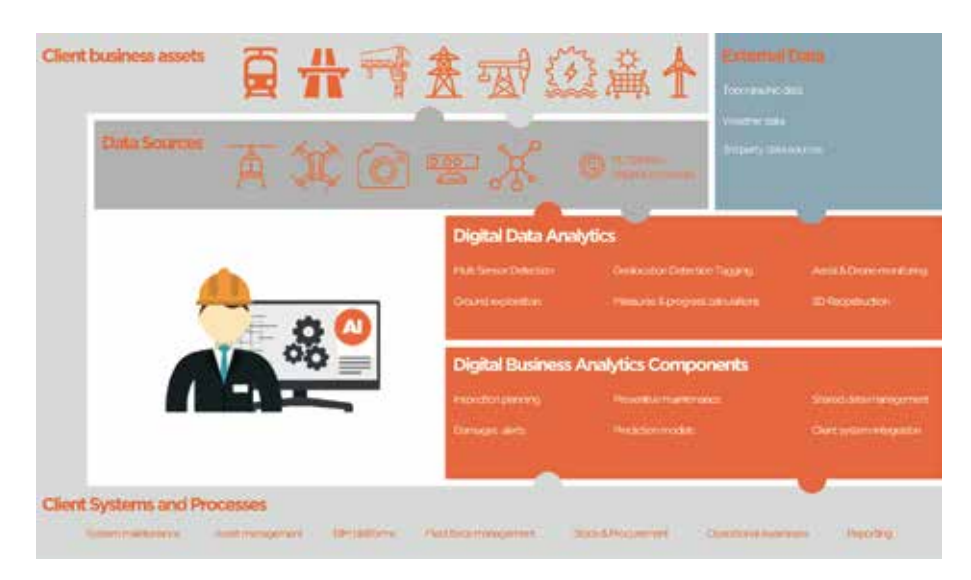
Fig. 4 - AI-Inspection, a complete workflow for UAV inspections.

phes. Uber is about to launch a new urban transportation service using unmanned vehicles. These are all missions with variable levels of importance and critical points. LAA access can't be completely democratic ("flat"), but must respond to the urgency and criticality of a mission. It will be necessary to outline fixed routes for exclusive usage for specific; either