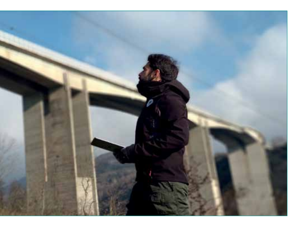
Fig. 5 - UAV inspector manages drone operations and inspection data on-site

To outline this set of rules and technologies one must verify that these can actually be carried out in reality. Experimental systems must be launched to simulate and study real conditions, with real drones that carry out different operations