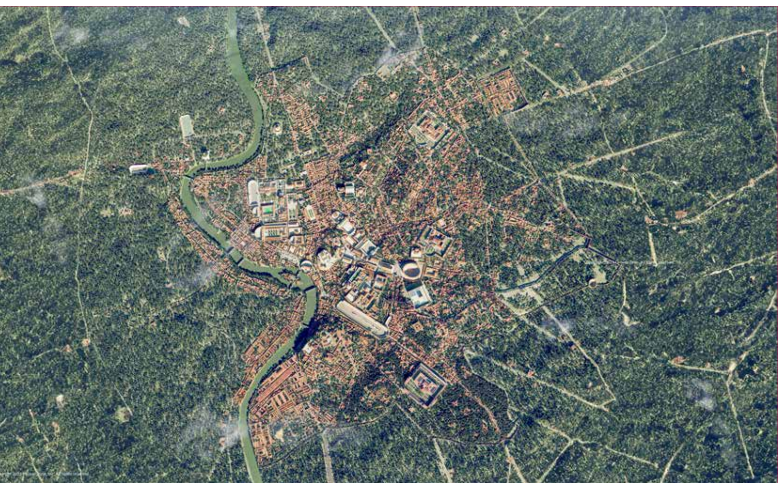
Aerial view of Rome Reborn 4.0, the 3D digital reconstruction of the entire city of ancient Rome within the Aurelian Walls as it appeared in the year AD 320.

We have a UX specialist who is responsible for our in-house testing. Afterwards, our virtual tours are tested in classroom situations by the teachers whose