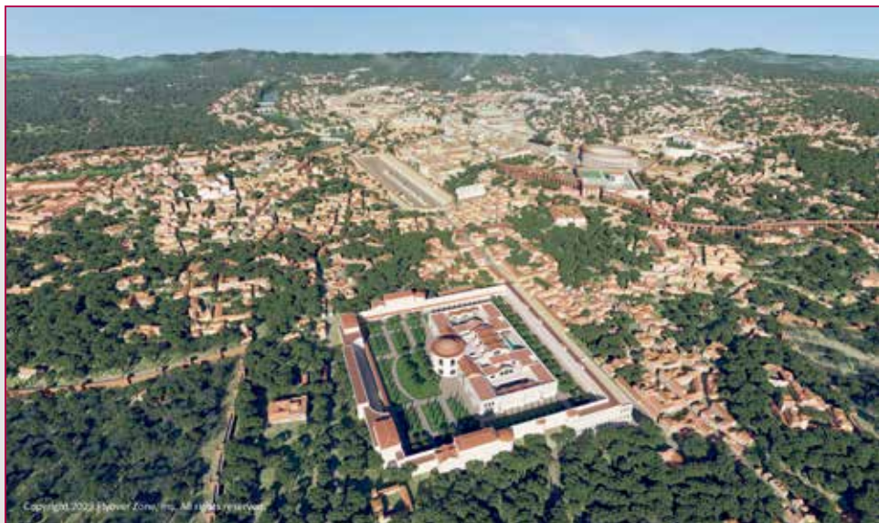
Aerial view of the city from the southeast. In the foreground are the Baths of Caracalla. In the middle ground can be made out the Circus Maximus (the 600-meter-long racetrack in the center of the image) and the Colosseum (to the right). In the distance is the Tiber River.

Version 1.0 included the Class I features in the Roman Forum. Everything else derived from a laser scan of the Plastico di