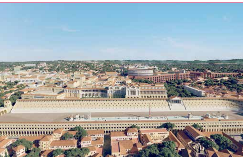
Aerial view of ancient Rome in AD 320. We are situated over the Aventine Hill and look toward the Circus Maximus and imperial palaces on the Palatine Hill. In the background (right) can be seen the Colosseum.

Ethical concerns fall into three categories relating to the individual contributors to Rome Reborn, the third-party owners of resources we may need permission to use, and the end users. Regarding our contributors, we give them public recogni-