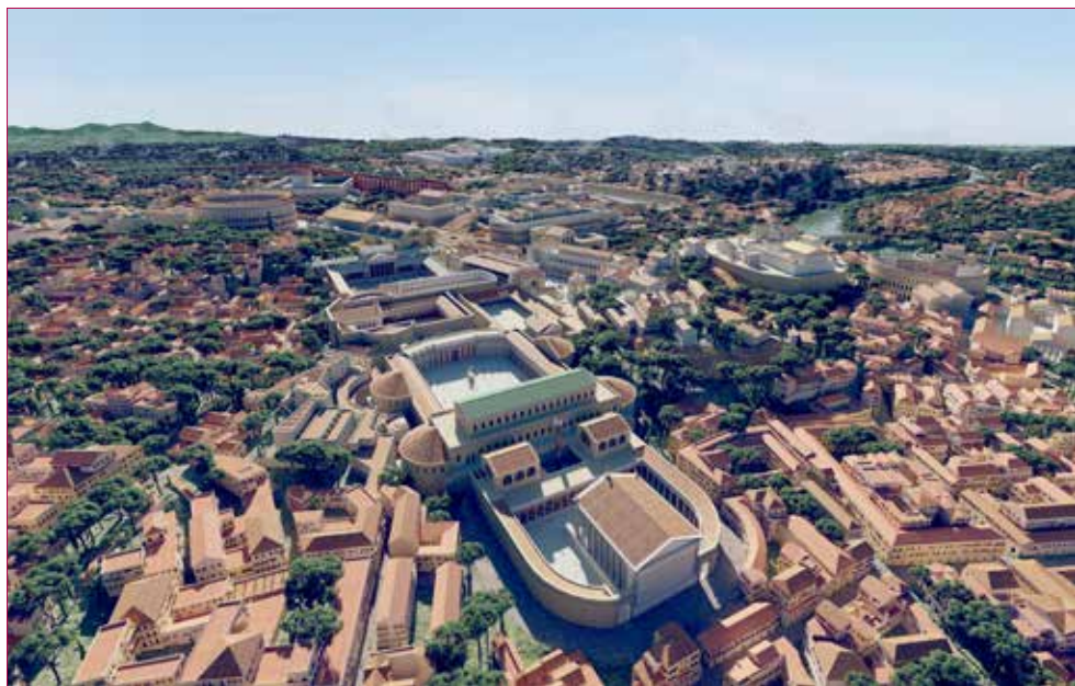
Aerial view of ancient Rome in AD 320 In the mid-ground are the imperial fora. The one at the bottom is the biggest: the Forum of Trajan. We can see (starting at the bottom) the Temple of the Divine Trajan and Plotina, the sculpted and painted Column of Trajan flanked by the Greek and Latin libraries, the Basilica Ulpia, and the entrance plaza with an equestrian statue of Trajan. After Trajan's Forum are the Forum of Augustus, the Forum of Nerva, and the Forum of Peace.