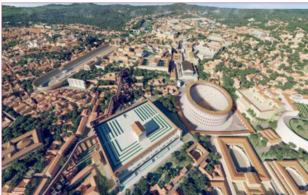
Aerial view of ancient Rome in AD 320. We are positioned to the east of the Colosseum (visible below the center of the picture). To the left is the Temple of the Divine Claudius on the Caelian Hill. Across the street from the Colosseum in the Temple of Venus and Rome, the largest of the sanctuaries of the state cult. To the left is the Palatine Hill; beyond can be seen the Roman Forum and imperial fora. In the distance can be made out the gilded dome of the Pantheon.