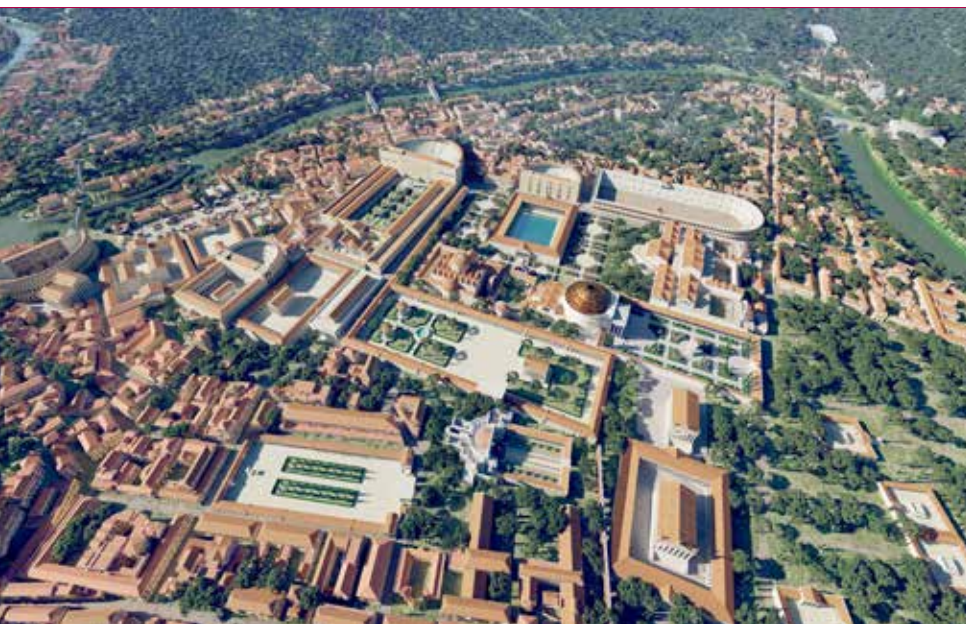
Aerial view of ancient Rome in AD 320 showing the Baths of Caracalla, one of the major public recreational facilities built by Emperor Caracalla (ruled AD 211-217).

Yes. We have a UX expert on staff who ensures that our user