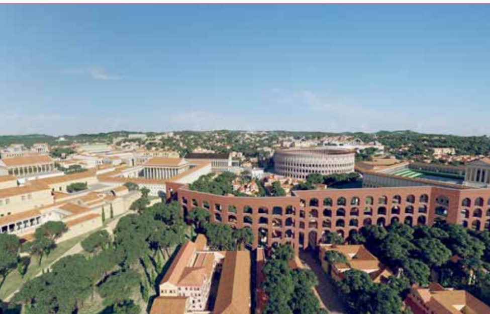
Aerial view of ancient Rome in AD 320. We are positioned over the valley between the Palatine Hill (left) and the Caelian Hill (right). In the middle ground is the Aqua Claudia, the aqueduct furnishing water to the imperial palaces on the Palatine. Right of the middle of the picture is the Colosseum.

Regarding AI, the answer is again “Yes!” We already have a prototype AI working code-named “Yorebot.” This is an addition to our user interface allowing our end users to pose their own questions during a virtual tour. We believe in giving our users maximum freedom to move through time and space