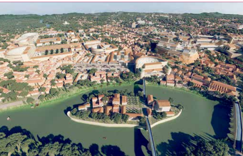
Aerial view of ancient Rome in AD 320. We are situated over Transtiberim (modern Trastevere) and look east toward the Tiber River, Tiber Island, and (left) the Campus Martius and (right) Capitoline Hill. On the Tiber Island can be seen (right) the Temple of Asclepius in front of which is an Egyptian obelisk.