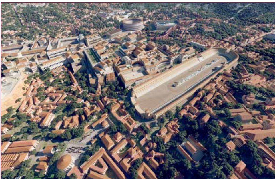
Aerial view of ancient Rome in AD 320. Similar view to what is seen on page 03, except we are positioned to the west of the Circus Maximus.