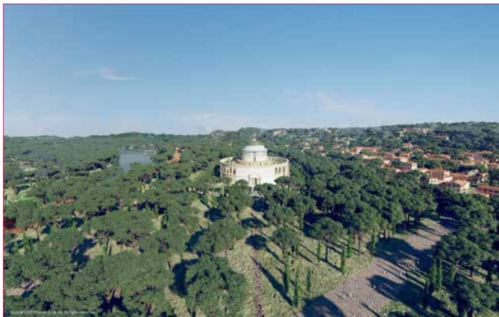
Aerial view of ancient Rome in AD 320 showing the Mausoleum of Augustus. Located near the banks of the Tiber River, the structure was due north of the Pantheon in the middle of a park laid out by Augustus in the Campus Martius. The tomb was topped by a colossal statue of Augustus. Inside were buried most of the emperors and imperial family members in the first century AD. The last emperor buried here was Nerva (ruled AD 96-98).

Yes, we have done lots of photogrammetry. Indeed, our company’s second streaming service (which I have not yet mentioned) is our Virtual Museum. It has over 700 interactive 3D models of classical sculpture and furniture almost all made by photogrammetry. The museum allows our users to study an individual work of art in isolation, taking advantage of the museum’s ability to let you pan, rotate, zoom, and change the lighting. We also provide standard metadata for the object